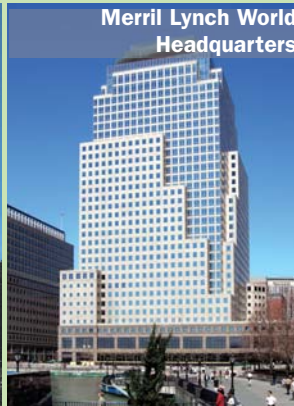
Merril Lynch World Headquarters