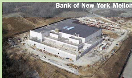
Bank of New York Mellon