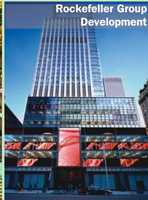
Rockefeller Group Development