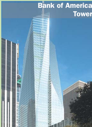
Bank of America Tower

Providers of Specialized Data Center Services Since 1990